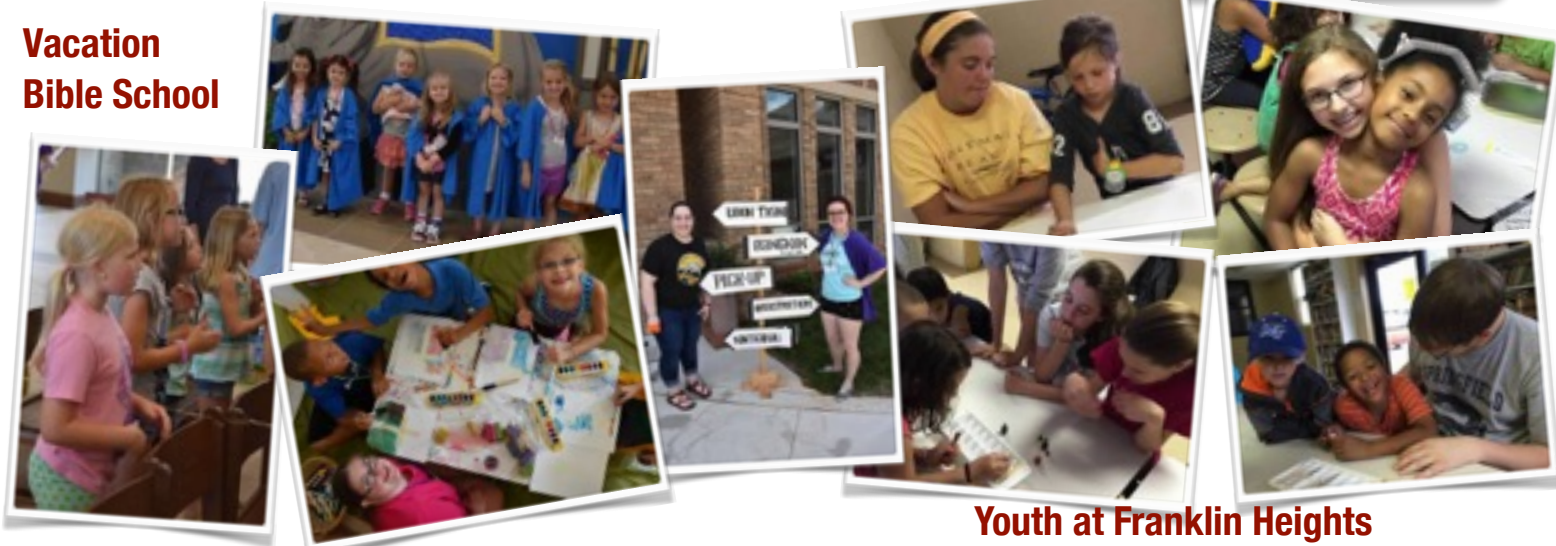
Youth at Franklin Heights